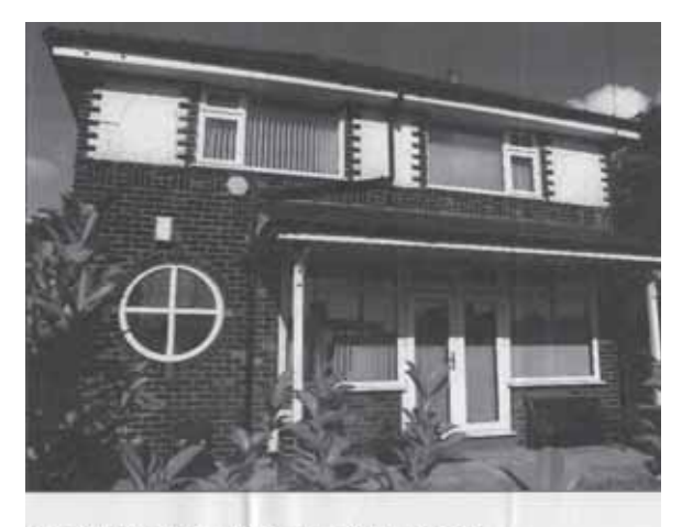
135 Brownedge Road, Lostock Hall, Preston, PR5 5AH

Betty Moorhouse, (nee Gent) Thornton - Cleveleys.